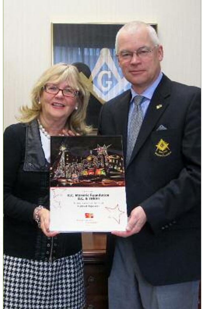
St. Paul's Hospital in Vancouver has been the recipient of a donation from this jurisdiction for several years.

The chamber reminds one's self of the caves where primitive men lived. In psychoanalysis, it is a symbol of regression. It is also a symbol of the maternal womb. The profane is regressing to a time of innocence and to a state in his mother's womb. When he emerges from the chamber, it shall be as if being born as a new man. Contrariwise, the cave can also be the symbol of a sepulchre, as the tombs of the ancients in biblical times. Thus, the chamber indicates, at the same time, a beginning and an end: the end of one's life as