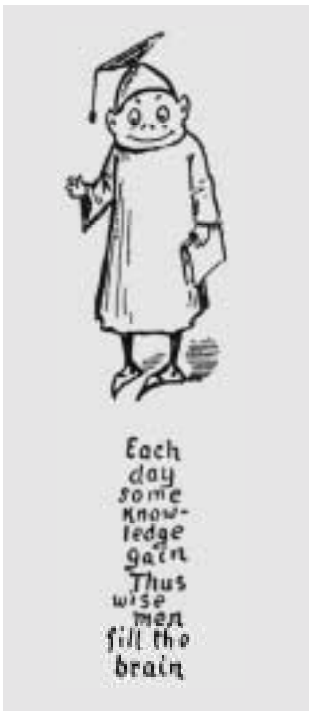
W Bro. Palmer Cox, 1893

However, I think that there is a more comprehensive message in the quotation. It is a message that includes all those