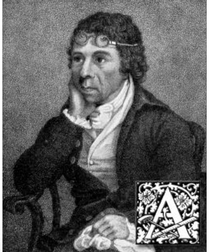
This portrait of the Rev. Dr. James Anderson (1680-1739), compiler of the first Book of Constitutions, appeared in Arthur Edward Waite's New Encyclopædia of Freemasonry in 1921. Bonus points for anyone who knows what is wrong with this portrait.

B is for Broken Column. Widely used as a symbol of mortality since ancient times, it is not referred to in our rituals. The introduction and history of what has been termed the Monument to the Master Builder should be of interest to all students of masonic symbolism. While Jeremy L. Cross (1783-1861) is often credited with devising this grouping of symbols incorporating a broken column, weeping maiden, Father Time, urn and acacia, they clearly predated his writings. The first suggestion of a monument for Hiram is thought to have been presented in Thomas Johnson's A Brief History of Freemasonry in 1782. It represented a Design for a Monument, in Honor of a Great Artist , which showed an urn on the top and above was