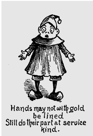
W Bro. Palmer Cox

During a recent official visit of RW Bro. Les Inglis to Tsawwassen Lodge No. 185 , the lodge presented the Grand Lodge Archives with a Past Master jewel to be added to the display in the Grand Lodge