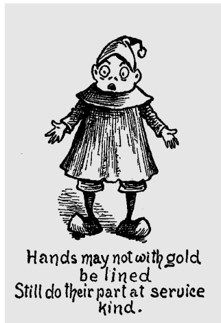
W Bro. Palmer Cox

On January 9, 2003 at 6:30 pm the lodge was called to order for the purpose of Initiating two candidates. This was carried out in fine fashion