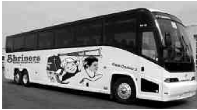
Even the exteriors of the Care Cruisers are unique, with a paint scheme that explains the Shriners mission.

The Care Cruisers, based in Burnaby, travel to Portland, Oregon, Prince George, Vancouver Island, Kamloops and Kelowna. Future service is