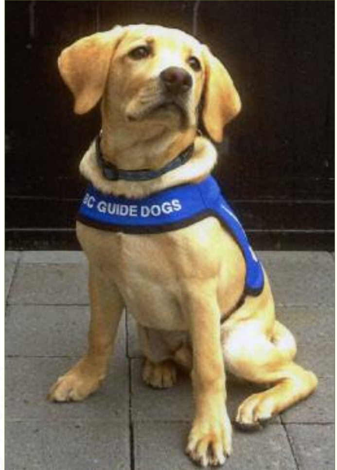
With the support of the British Columbia Masonic Foundation, 'Ashlar', a Yellow Labrador Retriever, has begun his training with the BC & Alberta Guide Dog Services

Switching to other financial issues, the Grand Treasurer