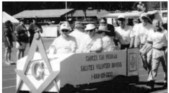
The District 7 roadster.

On this occasion the District 7 roadster was sporting the square and compasses emblem from the front of Corinthian Lodge No. 27's lodgehall as